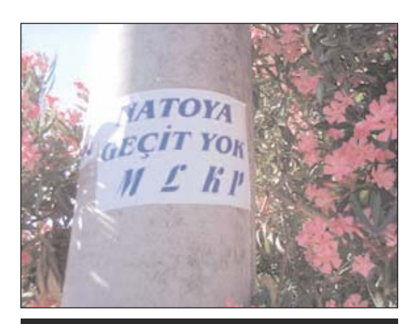
Do Not Let NATO Come Through! MLCP

We will expose the real face of those decorating themselves medals and selling our youth' blood for a few billion Dollars so that they will die in place of American soldiers.