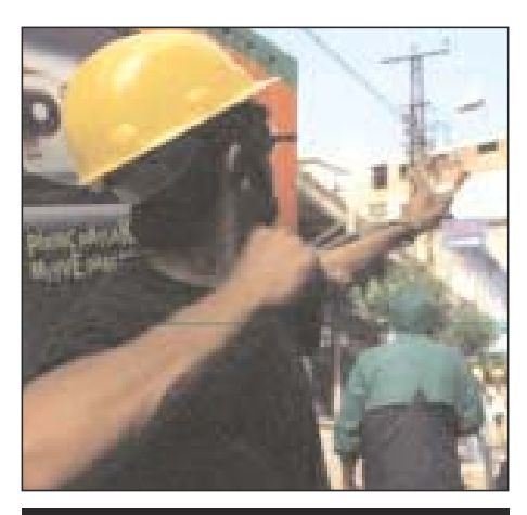
28 June 2004: Street fight in Okmeydanı/Istanbul

civilization. We will run over your lies and smash the bogey with which you are frightening the people.