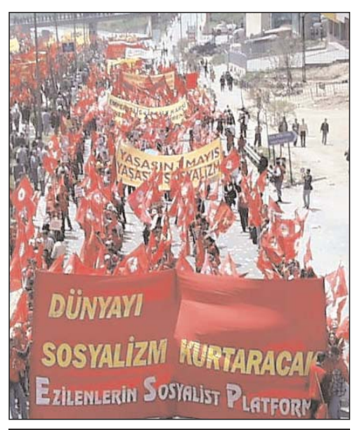
Socialist Platform of the Oppressed: Socialism will free the world!

In that case, where could the communist vanguard, which wants to put the opportunities of the revolutionary self-criticism -that still exists but are almost exhausted- to the service of her development, find the revolutionary propulsive power in order to ensure continuity of her