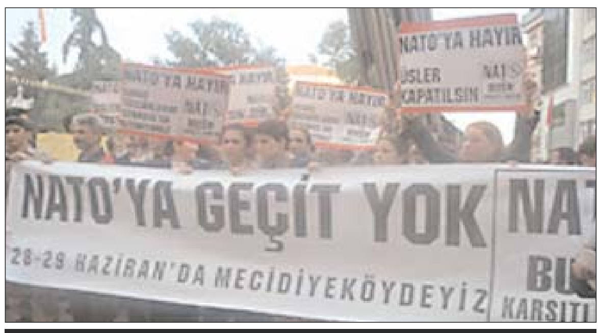
Unity Against NATO And Bush: Do Not Let NATO Come Through!